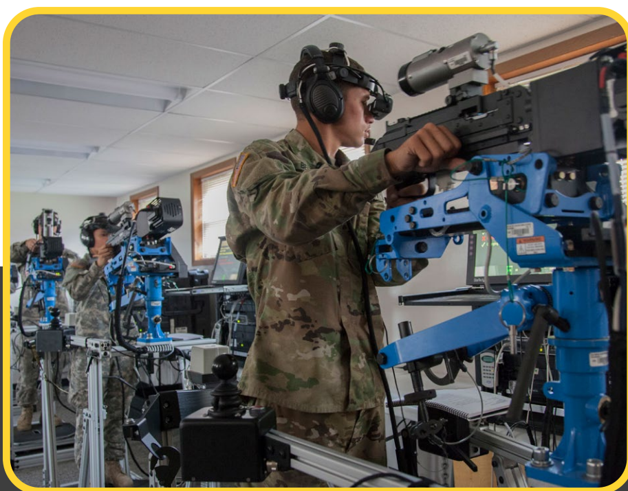
Soldiers with the 1485th Transportation Company operate simulated M2 .50-caliber machine guns in the Virtual Convoy Operations Trainer during the Golden Coyote exercise at Rapid City, S.D., June 13, 2017.

In 2005, the detachment moved to the new Coshocton Armory near the Coshocton Airport. On Sept. 1, 2007, the detachment was redesignated as the 1485th Transportation Company (-Det. 1). The Dover element was redesignated as Det. 1 and consolidated with the Steubenville element after the armory there was closed.