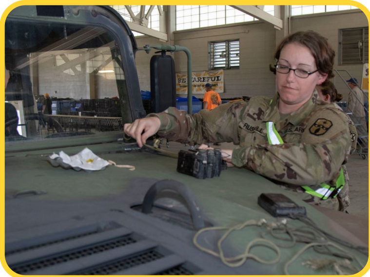
A unit supply specialist with the 1485th Transportation Company prepares sensors of a vehicle-mounted Multiple Integrated Laser Engagement System, or MILES gear, at the Joint Readiness Training Center, Fort Polk, La., May 2, 2019.