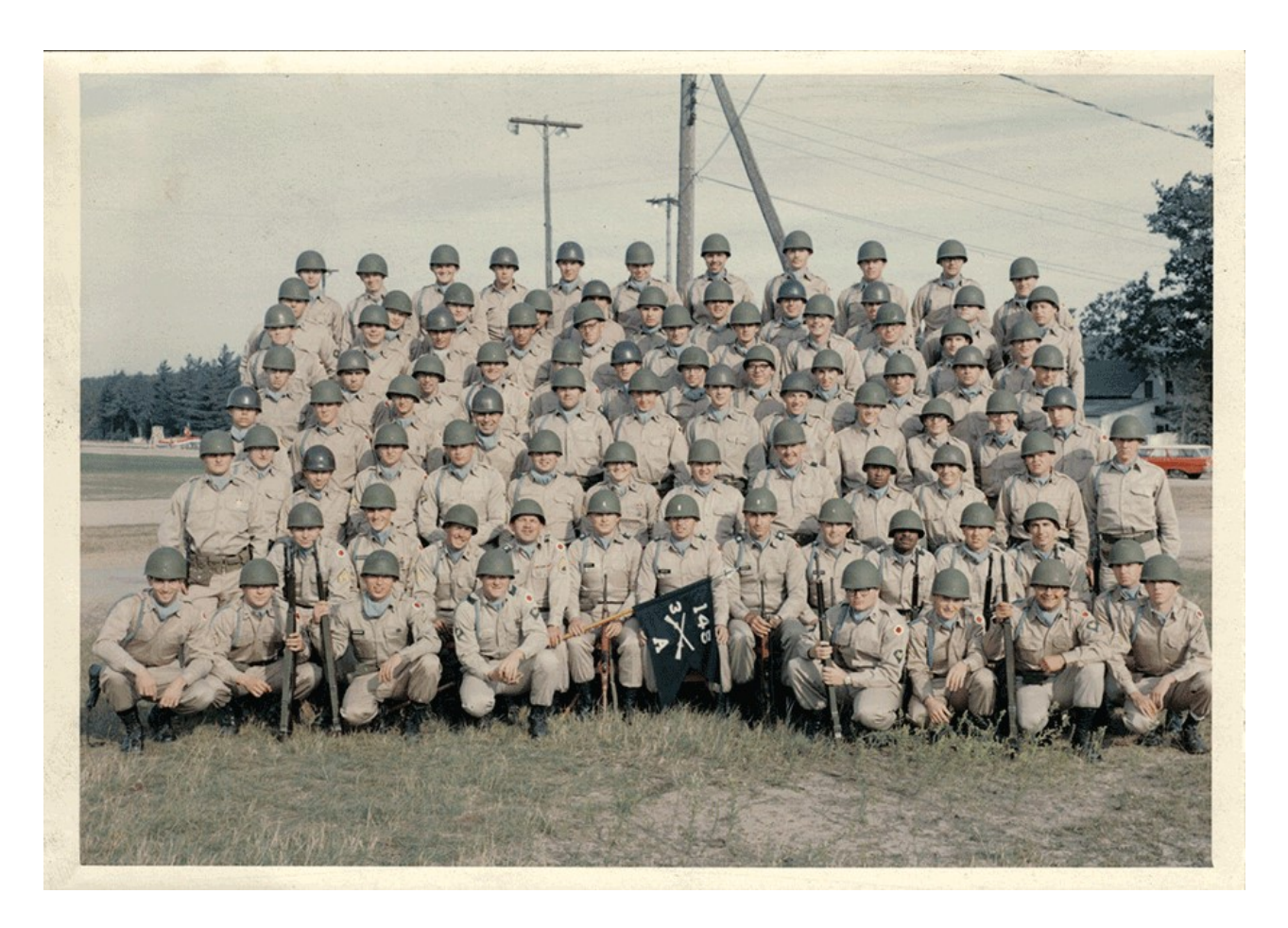
Company A, 3rd Battalion, 145th Infantry, Camp Grayling, Mich., 1965.