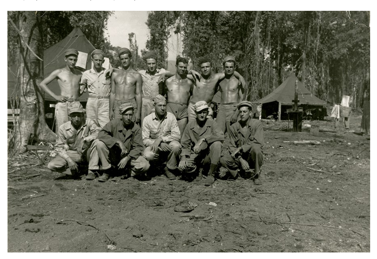
3rd Squad, 1st Platoon, Company I, 145th Infantry, Bougainville, November 1944.