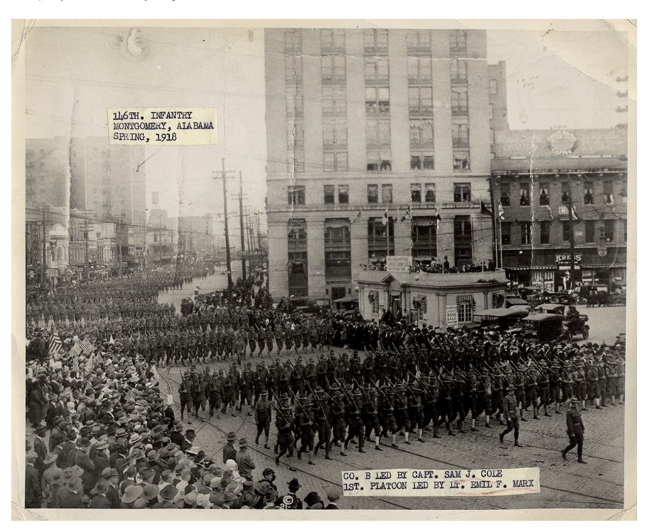
Company B, 146th Infantry on parade in Montgomery, Ala., 1918.