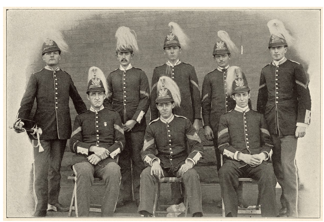
Noncommissioned officers, Company B, 8th Infantry Regiment, circa 1890.