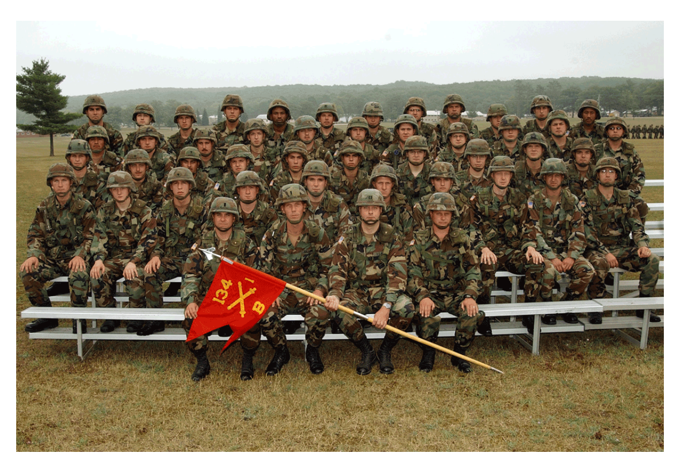
2005 ~ Battery B, 1st Battalion, 134th Field Artillery, Camp Grayling, Mich., 2005.