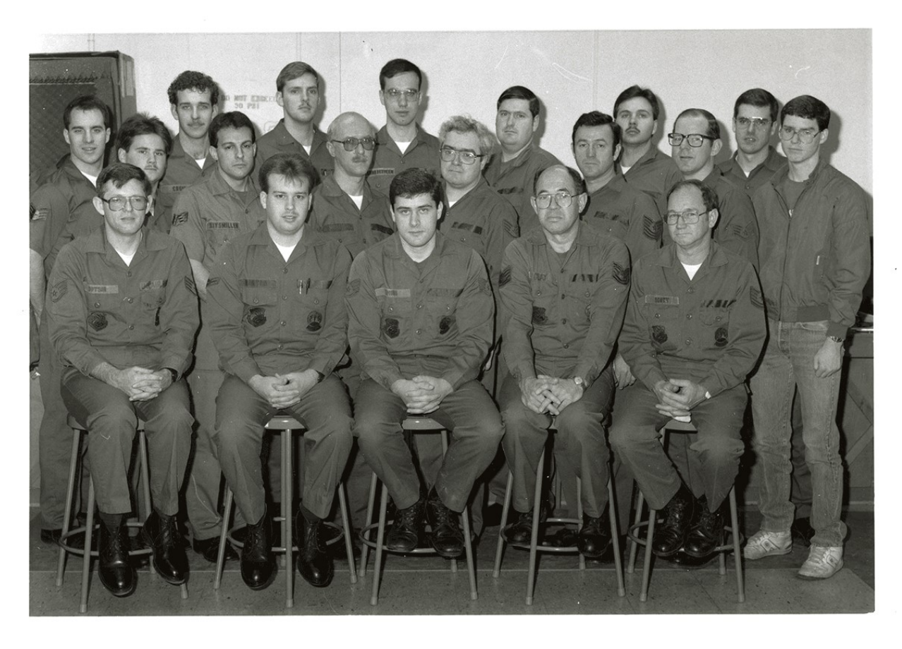
Group Radio section, 220th Engineering Installation Squadron, 1987.