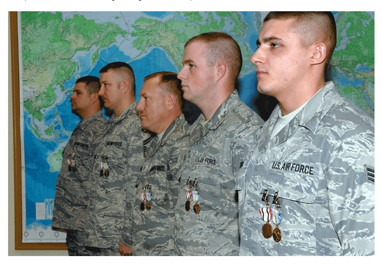
Airmen with the 220th Engineering Installation Squadron stand at attention after receiving medals for their deployment in support of the Global War on Terror, 2009.