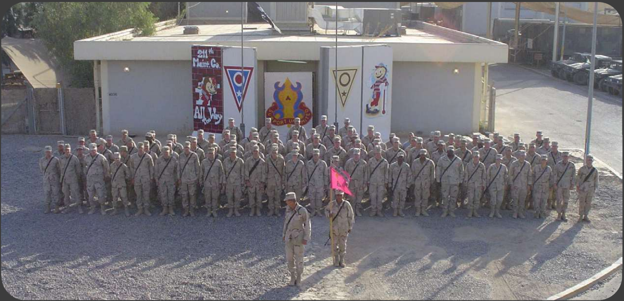
211th Maintenance Company, Iraq, 2005.