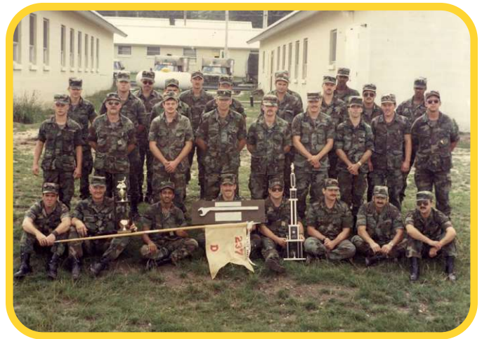
Company D, 237th Support Battalion, 73d Infantry Brigade, Camp Grayling, Mich., circa 1985.

Relieved 15 February 1968 from assignment to the 37th Infantry Division