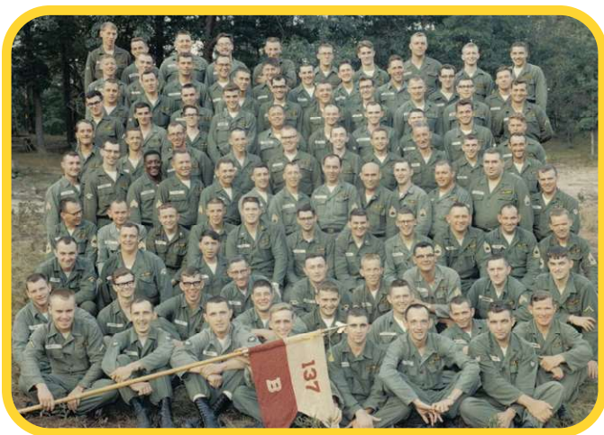
Company B, 137th Supply and Transportation Battalion, 37th Infantry Division, Camp Grayling, Mich., 1965.