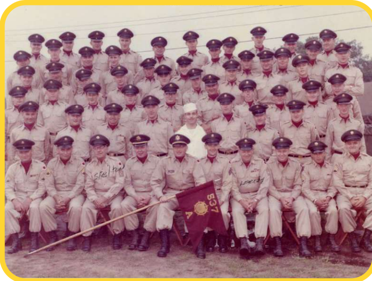
Company A, 537th Transportation Battalion, 37th Infantry Division, Camp Grayling, Mich., 1963.