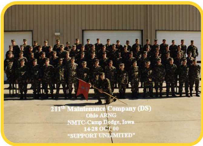
211th Maintenance Company, Camp Dodge, Iowa, Oct. 2000.