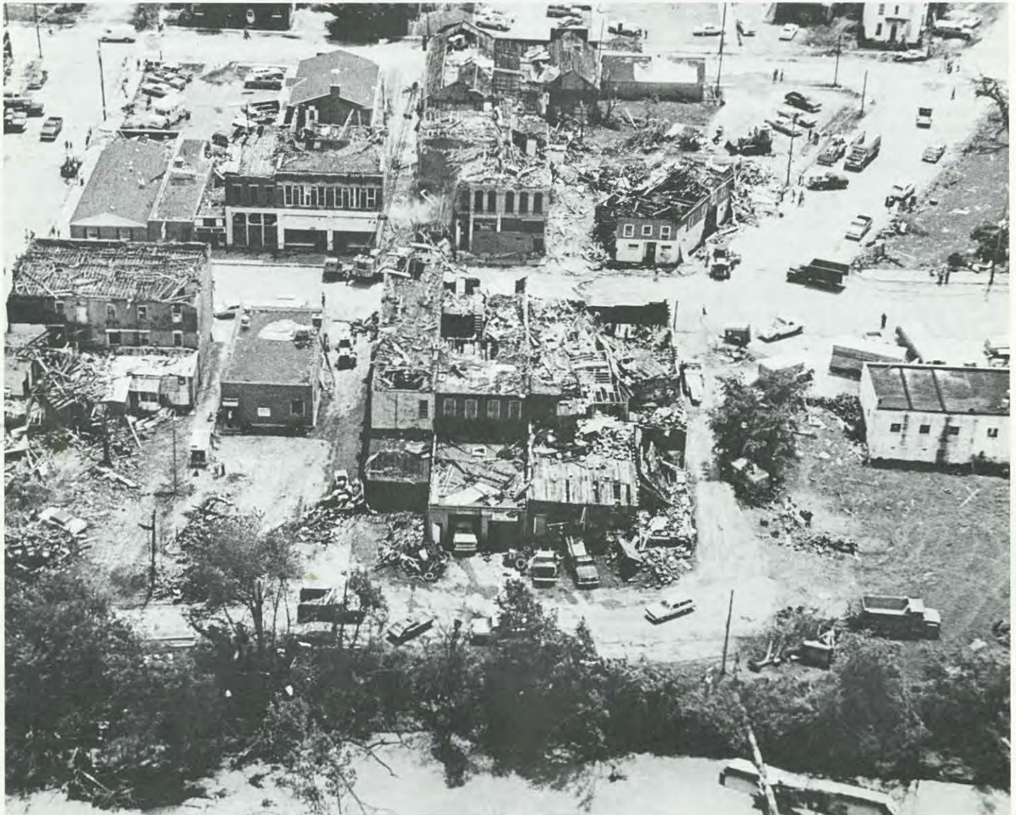
TORNADO DAMAGE GREAT — The tornado caused what Governor Rhodes referred to as the worst 'per capita' damage in Ohio's history. Most of the buildings in the business district of the town suffered major damage or complete destruction.

"In the areas of town hardest hit by the (Continued on next pg.)