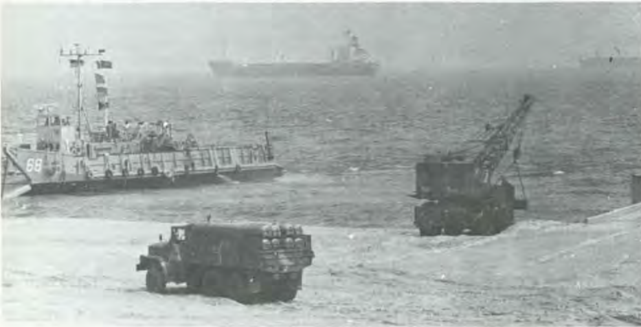
HIT THE BEACHES — The 112th transportation Battalion took part in Exercise "Translots XXI" as part of their Annual Training.