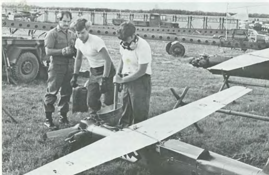
FUELING THE 'CAT