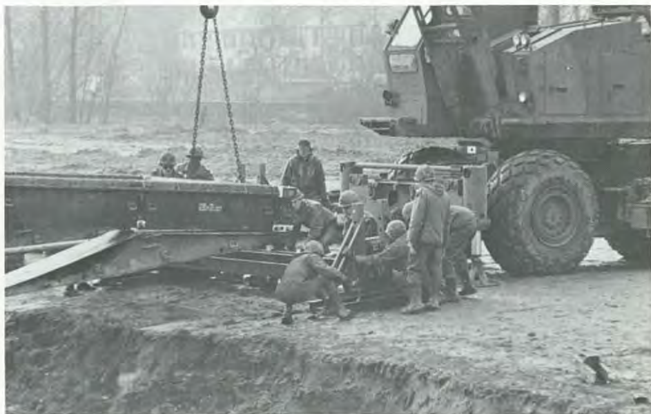
BUILDING A BRIDGE — 1193rd Engineers begin the last phase of work of the medium girder bridge. Use of heavy equipment was necessary to construct the bridge, which is capable of supporting some tracked and most wheeled vehicles.