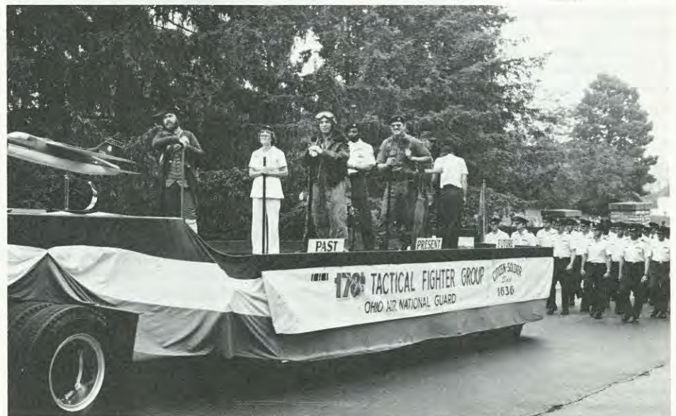
ON PARADE — The 178th Tactical Fighter Group float representing the Guard's past, present and future.

A float representing the Guard's past, present, and future provided onlookers the opportunity to view the uniforms of the Guard and preceded 75 officers and airmen who were marching in exact cadence. Vehicles from the 251st Combat Communications Group completed the Guard segment of the parade.