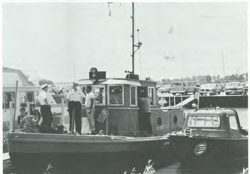
IN PORT — Members of the Ohio Naval Militia survey their craft. The militia helped recover target drones at Camp Perry.