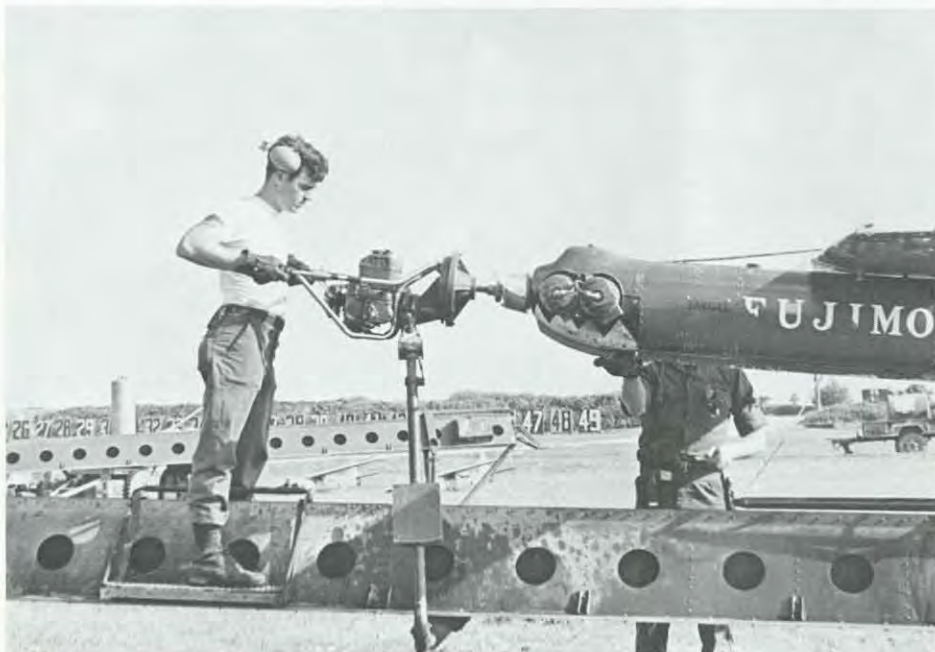
STARTING THE 'CAT