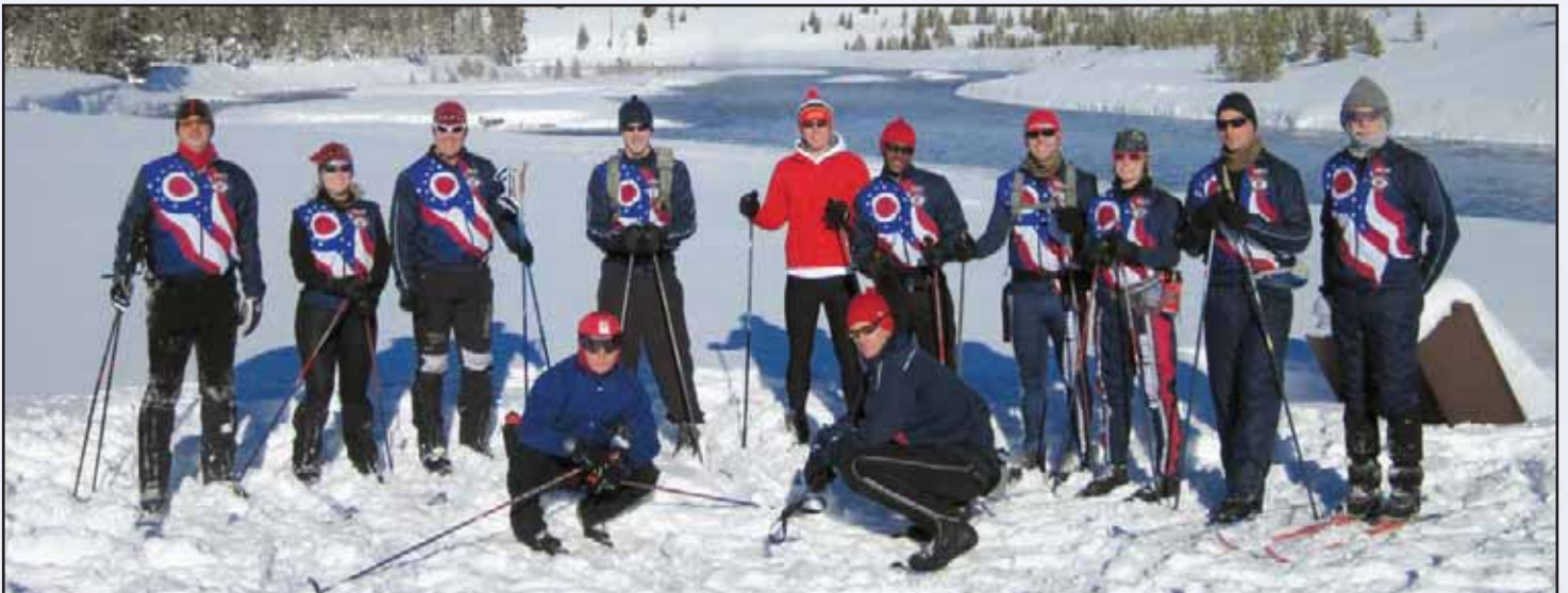
The 2011 Ohio National Guard Biathlon Team poses for a group photograph on the Madison River in Yellowstone, Mont., prior to the 2011 Central Regional Biathlon. The team was in Yellowstone to train for the biathlon held Jan. 12-15, 2011, at Camp Ripley, Minn.