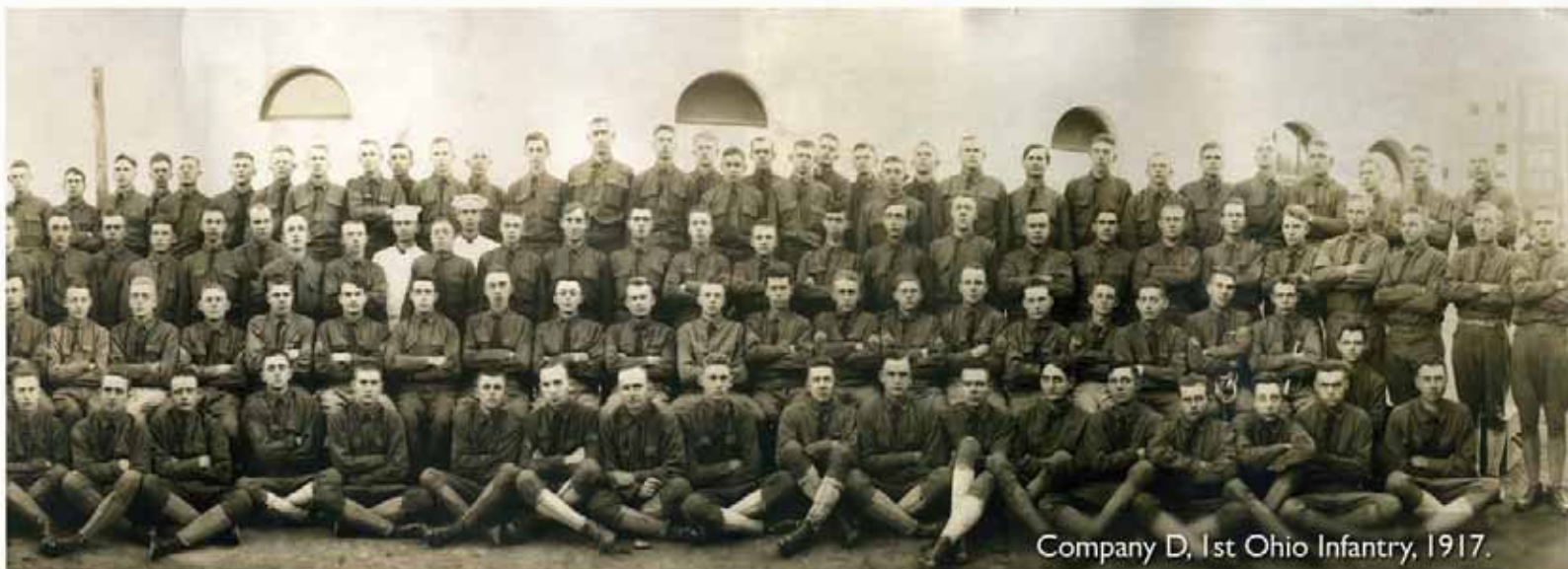
Company D, 1st Ohio Infantry, 1917.