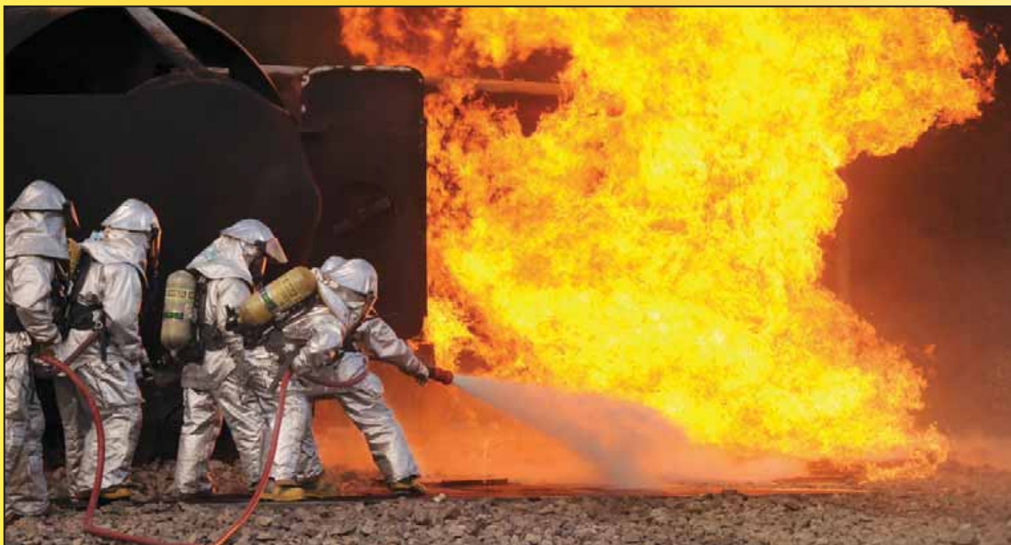
Firefighters from the 180th Fighter Wing extinguish an aircraft fire during a training exercise at the Phelps Collins Combat Readiness Training Center, Alpena, Mich., Oct. 16, 2010. The firefighters are attending annual training to keep their skills sharp and maintain their certifications.