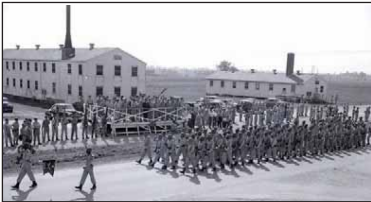
Soldiers from Company A, 372d Infantry Battalion, conduct a formal pass in review during annual training at Camp Atterbury, Ind., in 1950.