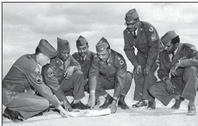
Officers and noncommissioned officers of the 137th Anti-aircraft Artillery Battalion, 37th Infantry Division, look over a map while training at Fort Bliss, Texas, in 1952. The all-black battalion was called into federal service in January 1952, serving 2 years on active duty before returning to Ohio.

The battalion quickly reorganized and in the years prior to World War I, answered many calls to aid Ohio citizens. In 1917, the 9th was drafted into federal service for World War I and was