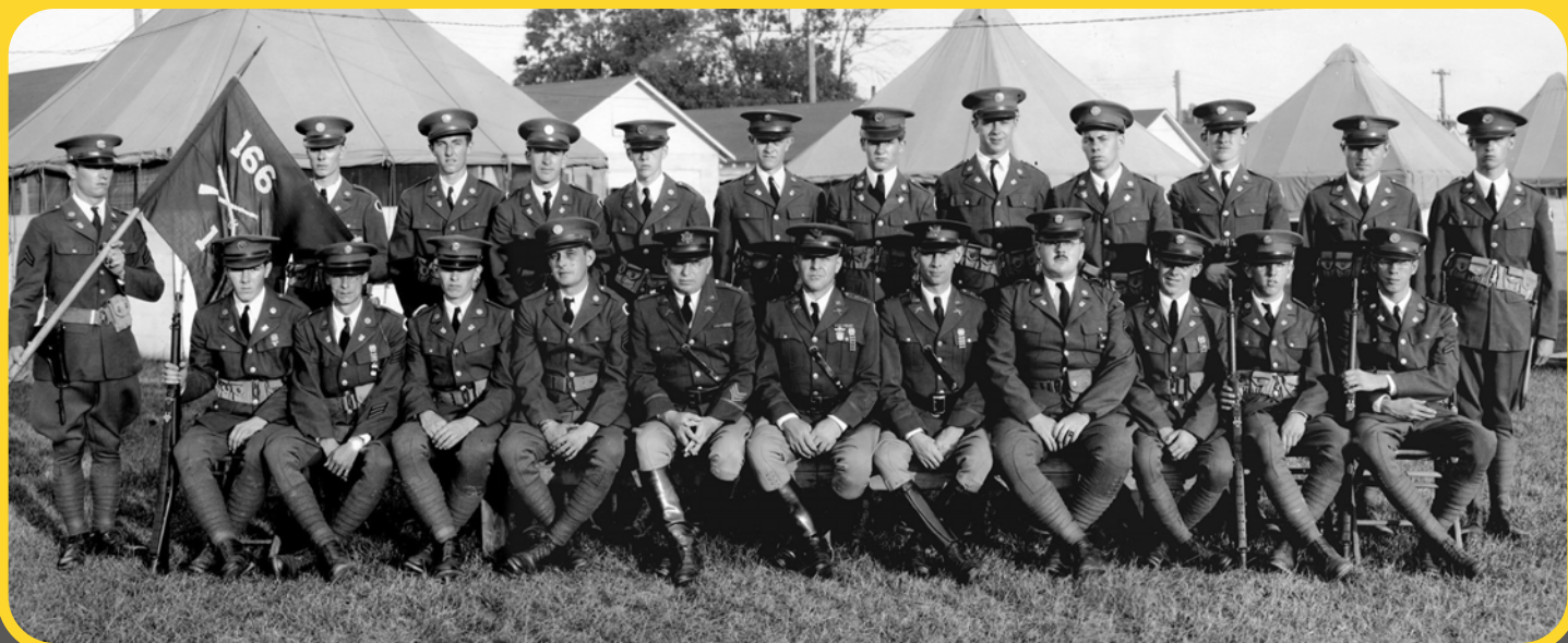
Headquarters Company, 1st Battalion, 166th Infantry, 37th Division, Camp Perry, Ohio, 1935.