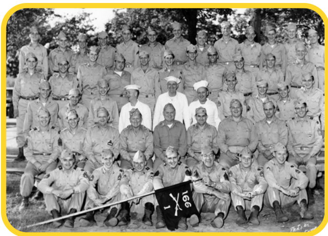
Headquarters and Headquarters Company, 1st Battalion, 166th Infantry, Camp Grayling, Mich., 1953.