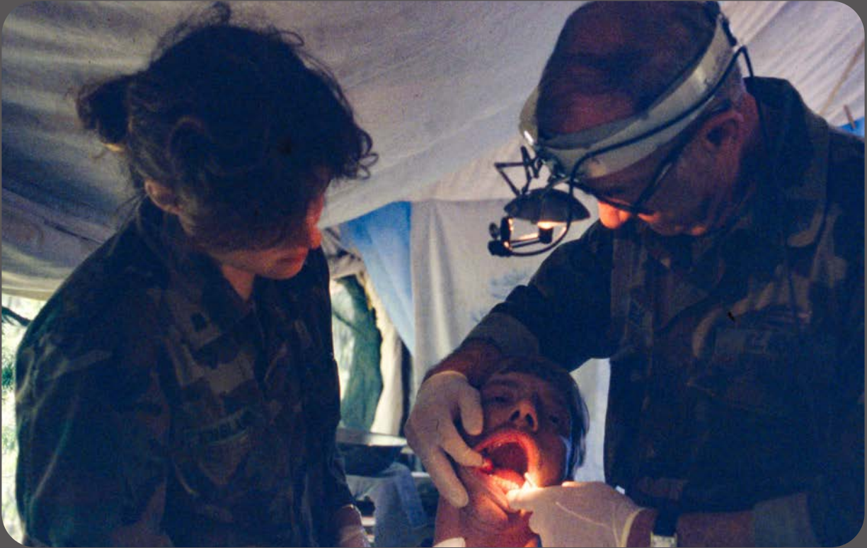
A dentist from Company B, 237th Support Battalion, 73d Infantry Brigade, looks at a Soldier's teeth in the field during annual training at Camp Grayling, Mich. in 1984.

Ordered into active Federal service 7 August 2022 at Columbus; released from active Federal service 10 September 2023 and reverted to state control