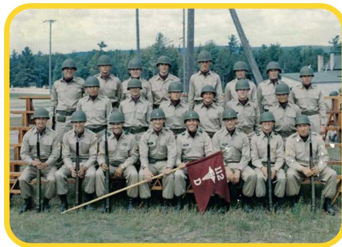
Company D, 112th Medical Battalion, 37th Infantry Division, Camp Grayling, Mich., 1965.

Converted, reorganized and redesignated 1 April 1963 as Company D, 112th Medical Battalion