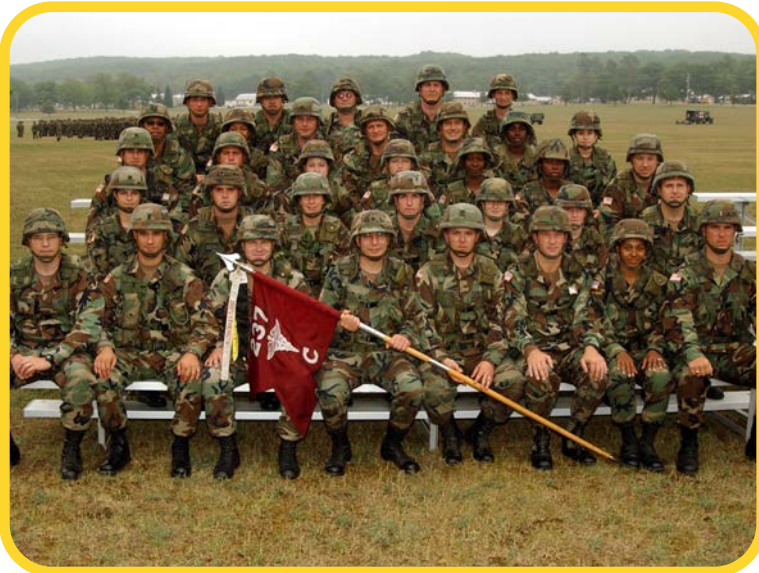
Company C, 237th Support Battalion, 37th Brigade, 38th Infantry Division, Camp Grayling, Mich., 2005.