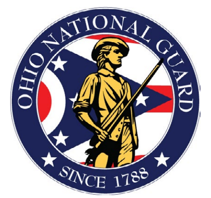
Updated as of Dec. 7, 2023

This historical sketch is published IAW AGOR 870-5 by the office of the Historian, Ohio National Guard. This history reflects the approved lineage and honors of the unit as determined by the U.S. Army Center of Military History. All photographs used, unless otherwise cited, are from the Ohio National Guard Heritage Center. Errors, corrections and suggestions may be submitted to: