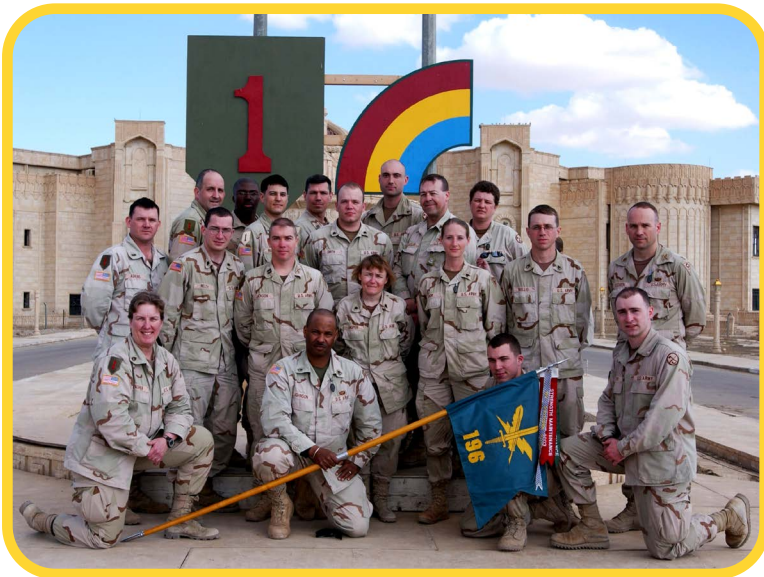
Members of the 196th Public Affairs Detachment pose for a unit photograph at FOB Danger in Tikrit, Iraq during their mobilization in support of Operation Iraqi Freedom in 2004.