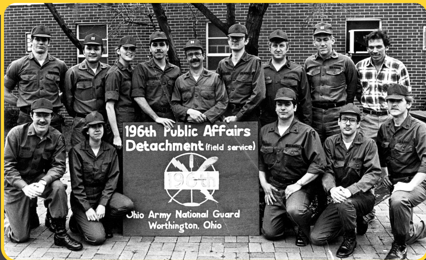
196th Public Affairs Detachment members pose for a unit photo at Maj. Gen. Robert S. Beightler Armory, Columbus, c. 1980.