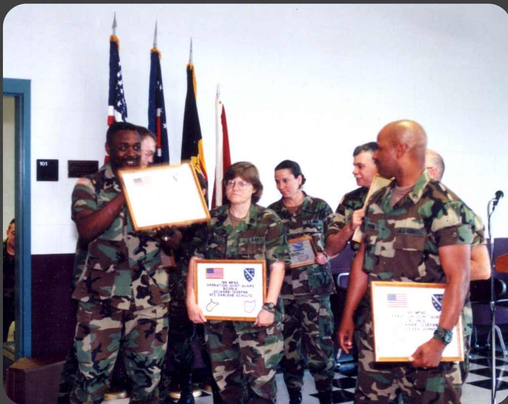
Members of the 196th Public Affairs Detachment are recognized after returning to Columbus from an eight-month mobilization to Bosnia in support of the NATO-led peacekeeping mission Operation Joint Forge on Sept. 11, 1998.