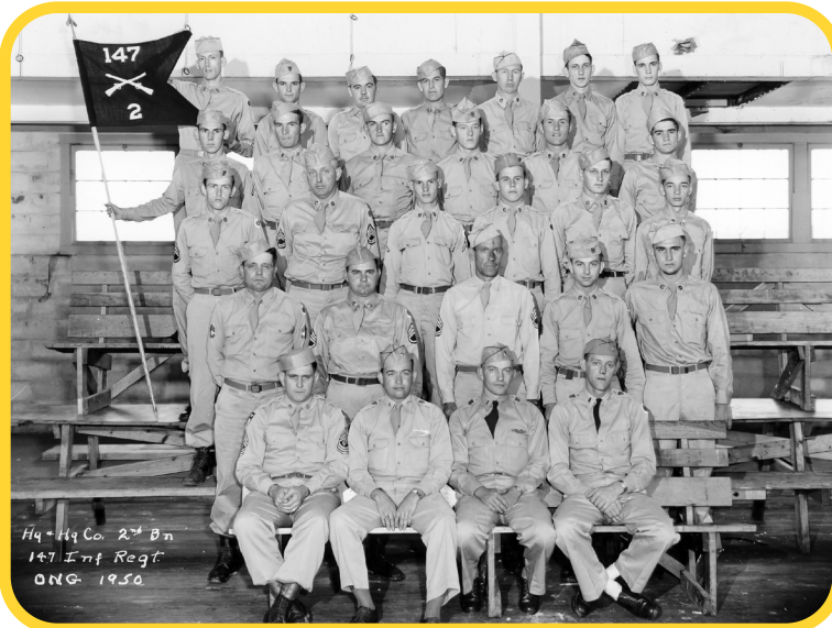
Headquarters and Headquarters Company, 2d Battalion, 147th Infantry, Camp Atterbury, Ind., 1950