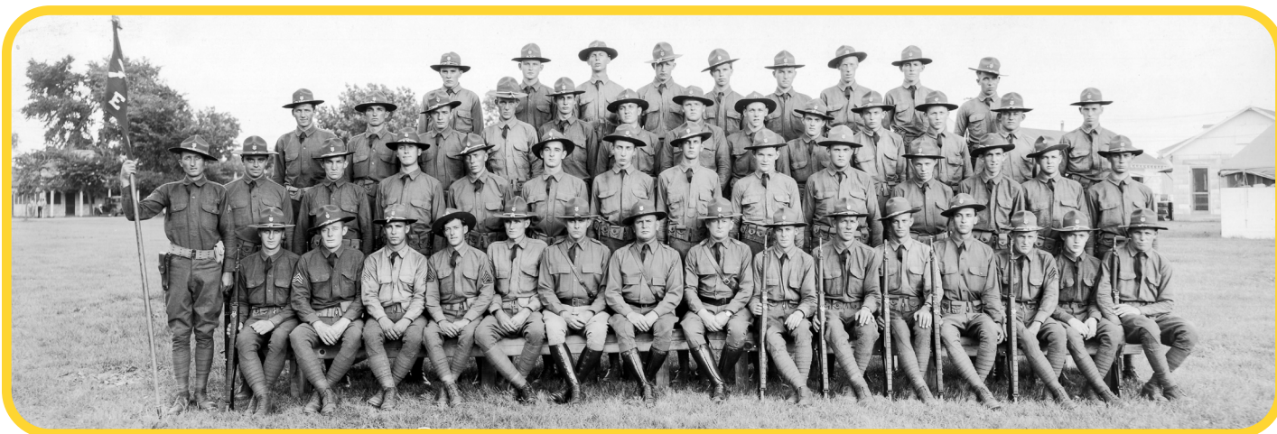
Company E, 147th Infantry Regiment, Camp Perry, Ohio, 1935.

Redesignated 1 January 1922 as Company I, 147th Infantry