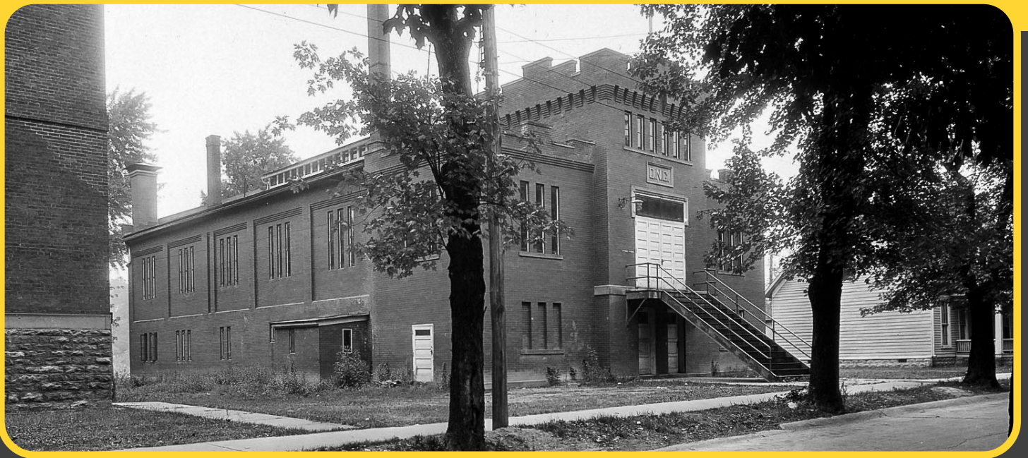
1st Sgt. Jack E. Pettit Armory, Manchester, Ohio.