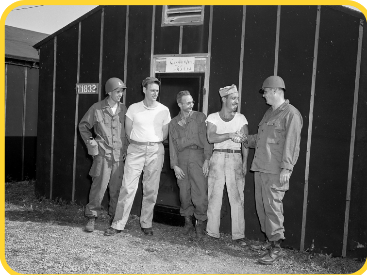
Soldiers from Headquarters and Headquarters Detachment, 38th Ordnance Battalion stand outside of a building marked "Cook Quarters" during training at Camp Perry, Ohio, circa 1950.