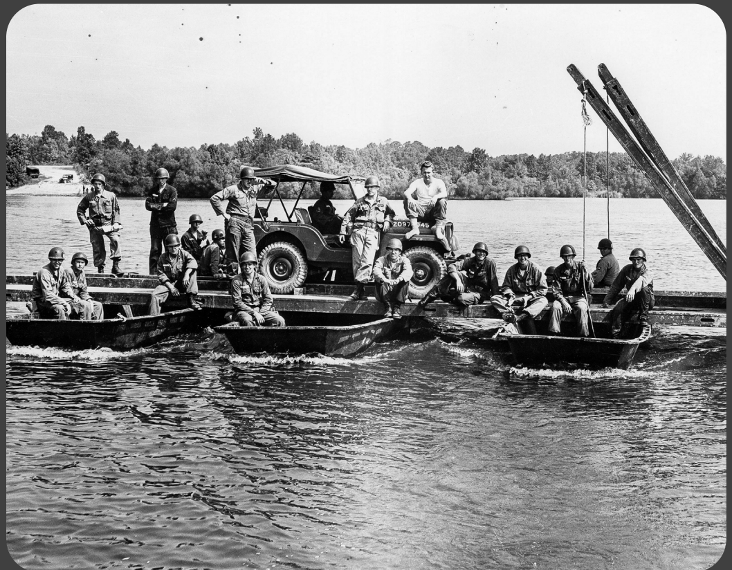
Soldiers from Company B, 112th Engineer Battalion test their "do it yourself" ferry on Des Islet Lake, Camp Breckinridge, Ky., 1958.

Location changed 1 January 2006 to Woodlawn