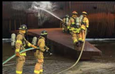
16TH ENGINEER BRIGADE 1,700 Members