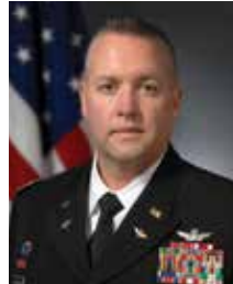
STATE COMMAND CHIEF WARRANT OFFICER

Responsible for establishing policies, priorities, and oversight for the readiness of Ohio National Guard Soldiers in six brigade-level major subordinate commands.