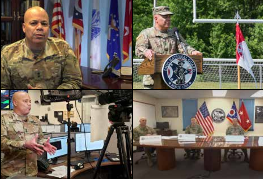
TABLE OF CONTENTS ANNUAL REPORT 2020