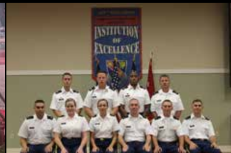
147TH REGIMENT, REGIONAL TRAINING INSTITUTE 150 Members