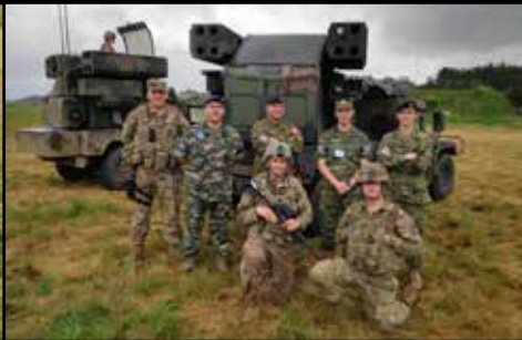
174TH AIR DEFENSE ARTILLERY BRIGADE 1,000 Members