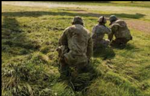
73RD TROOP COMMAND 2,200 Members

Historic renovations to the Hough Auditorium at Camp Perry Joint Training Center in Port Clinton, Ohio, won a Preservation Merit Award from the Ohio History Connection for a $1.6 million federally-funded renovation project that upgraded the interior of the theater, including new seating, restrooms, and lighting.