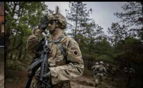
37TH INFANTRY BRIGADE COMBAT TEAM 3,700 Members