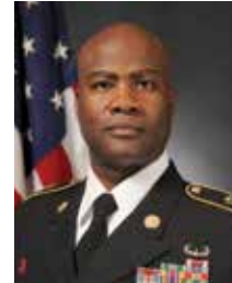
STATE COMMAND SERGEANT MAJOR

Provides direction, guidance, resources, assistance, and supervision of the Ohio Army National Guard Warrant Officer Corps, overseeing warrant officer leader development and mentorship while providing essential advice to the Assistant Adjutant General on warrant officer issues.