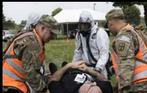
HOMELAND RESPONSE FORCE 580 Members

AEROSPACE CONTROL ALERT MISSION OHIO CYBER RESERVE STATE PARTNERSHIP PROGRAM