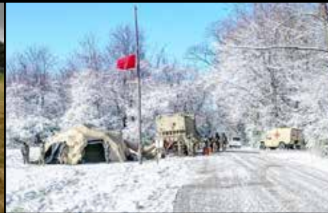
371ST SUSTAINMENT BRIGADE 1,800 Members