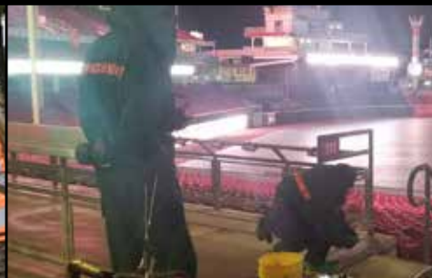
52ND CIVIL SUPPORT TEAM Weapons Of Mass Destruction 20 Members