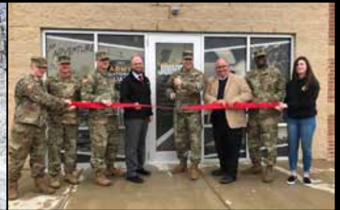
SPECIAL TROOPS COMMAND (PROVISIONAL) 1,000 Members