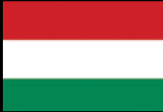
HUNGARY Since 1993

Ohio's partnership with Hungary was established on July 14, 1993, with the signing of a bilateral affairs agreement. The Ohio-Hungary pairing was chosen, in part, due to the large population of ethnic Hungarians throughout Ohio (the most of any state), especially in the metropolitan areas of Columbus, Cleveland, Dayton, and Toledo, as well as shared geographic features. Since the establishment of the partnership, Ohio and Hungary have conducted more than 150 State Partnership Program events in several security cooperation activities ranging from bilateral familiarizations, small unit exchanges, exercises, senior military and civic leader visits to deployments of joint Operational Mentoring and Liaison Teams (OMLTs), in support of Operation Enduring Freedom, which trained Afghan military and police forces.