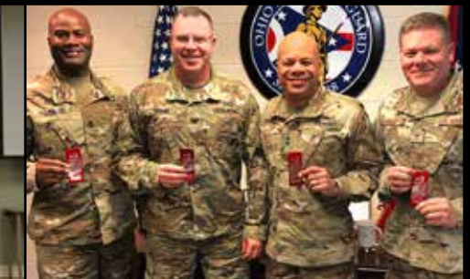
COUNTERDRUG TASK FORCE 50 Members