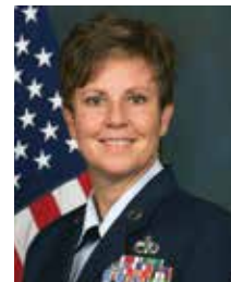
STATE COMMAND CHIEF

Principal deputy to the Assistant Adjutant General for Air; assists in management of the organization's operations, administration, mission readiness, and policies.