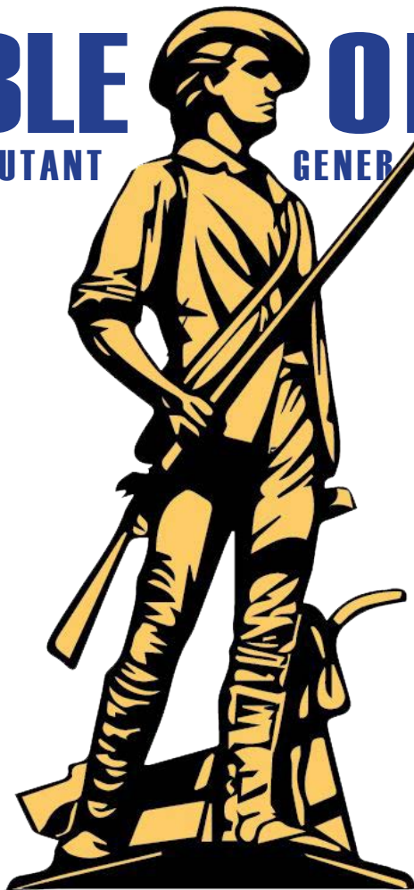
TABLE OF CONTENTS OHIO ADJUTANT GENERAL'S DEPARTMENT ANNUAL REPORT

We will be the nation's most modern, interoperable, and cohesive, locally based force; developing innovative, transformational professionals committed to bringing order out of chaos, and equipped with the foresight to anticipate future challenges.