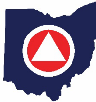
STATE DEFENSE FORCE