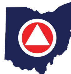
STATE DEFENSE FORCE