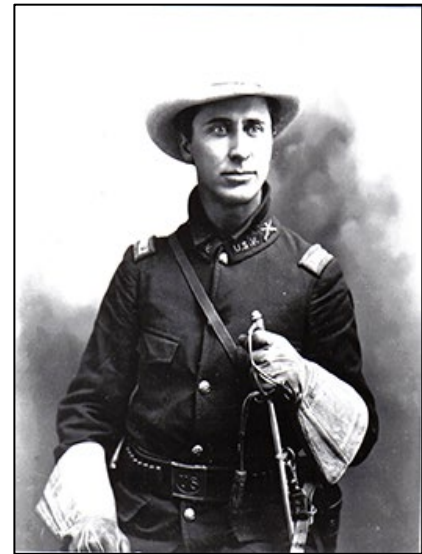
Major General Charles Dick

In addition to the United States Constitution, the Dick Act and the National Defense Act of 1916 became the most important legislative items in the history of the guard. Senator Dick's vision for a National Guard became reality in 1916 when the Ohio National Guard was mobilized for service along the Mexican Border. Over 7,000 Ohio National Guard Soldiers mustered at Camp Willis, near Upper Arlington, in June and began to arrive in Texas by late August.