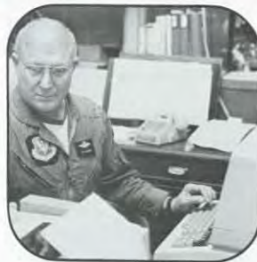
4 — Computers A Way of Life