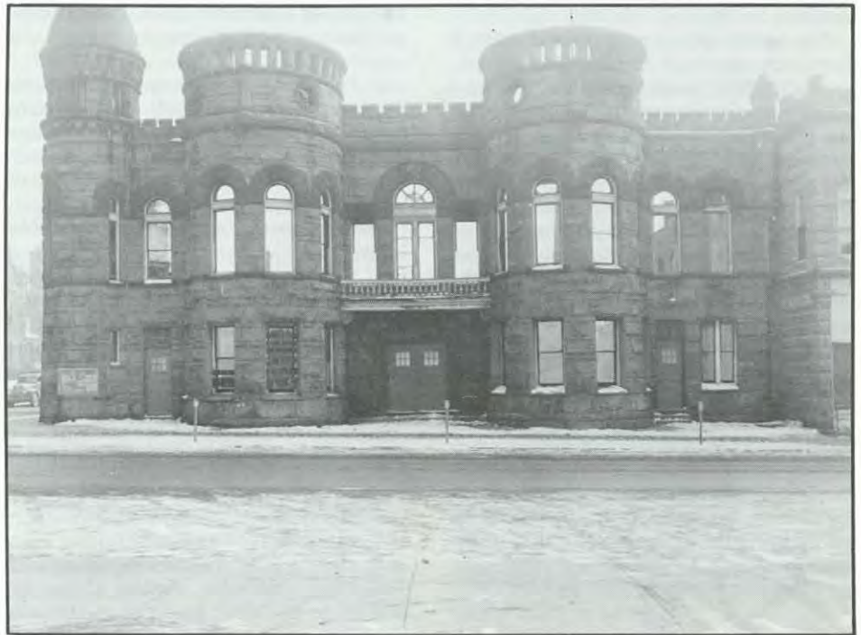
HISTORICAL LANDMARK — After the fire of 1947 gutted its interior, the cold winter winds had little affect on the massive stone walls of the Kenton Armory. Rebuilding was started the following spring, and the armory was operating once again in 1949.

The Kenton Armory has served the Ohio Army National Guard and the City of Kenton well. The massive stone walls have withstood the test of time and have become a historical landmark for the city and for the Ohio Army National Guard.