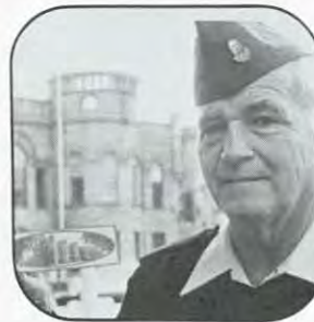
8 — Old Army Built Tough