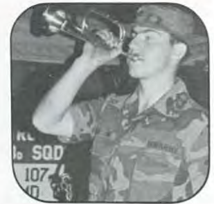
15 — Troop I Bugler Self-Made