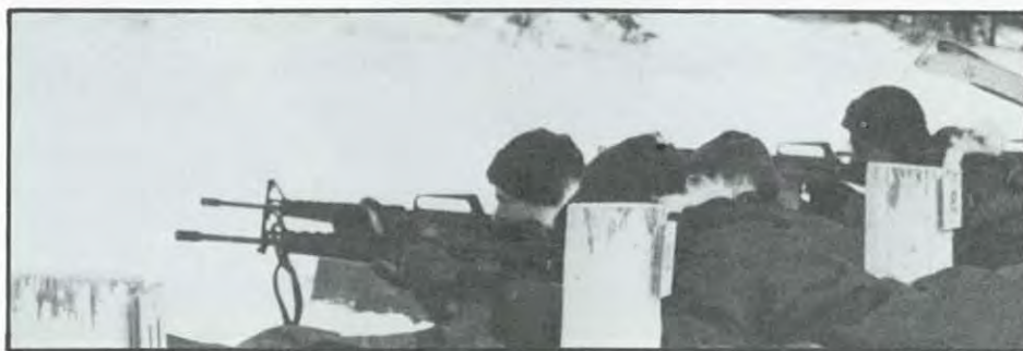
LOOKING FOR SHOT PATTERN — Ohio National Guard soldiers zero in their M-16 rifles on a target down range in preparation for a "biathlon" competition during winter survival training.