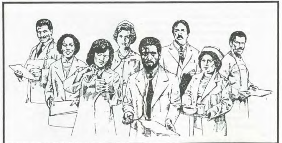
The Army medical team is studying ways to control the AIDS disease.

We have already alluded to the special problems that can occur in military personnel who are likely to enter combat. Also they may enter theaters of military action where there is a possibility of Chemical/Biological Warfare which would already impact upon