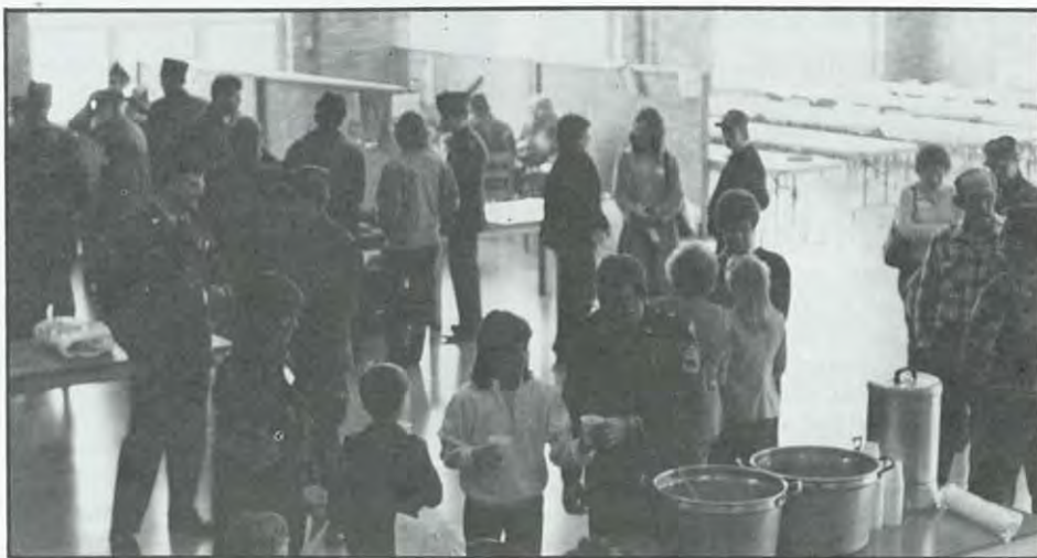
REFRESHMENTS SERVED — Families and employers of members of the 214th Maintenance Company at Coshocton and its Detachment 1 at Newark take time out for refreshments.