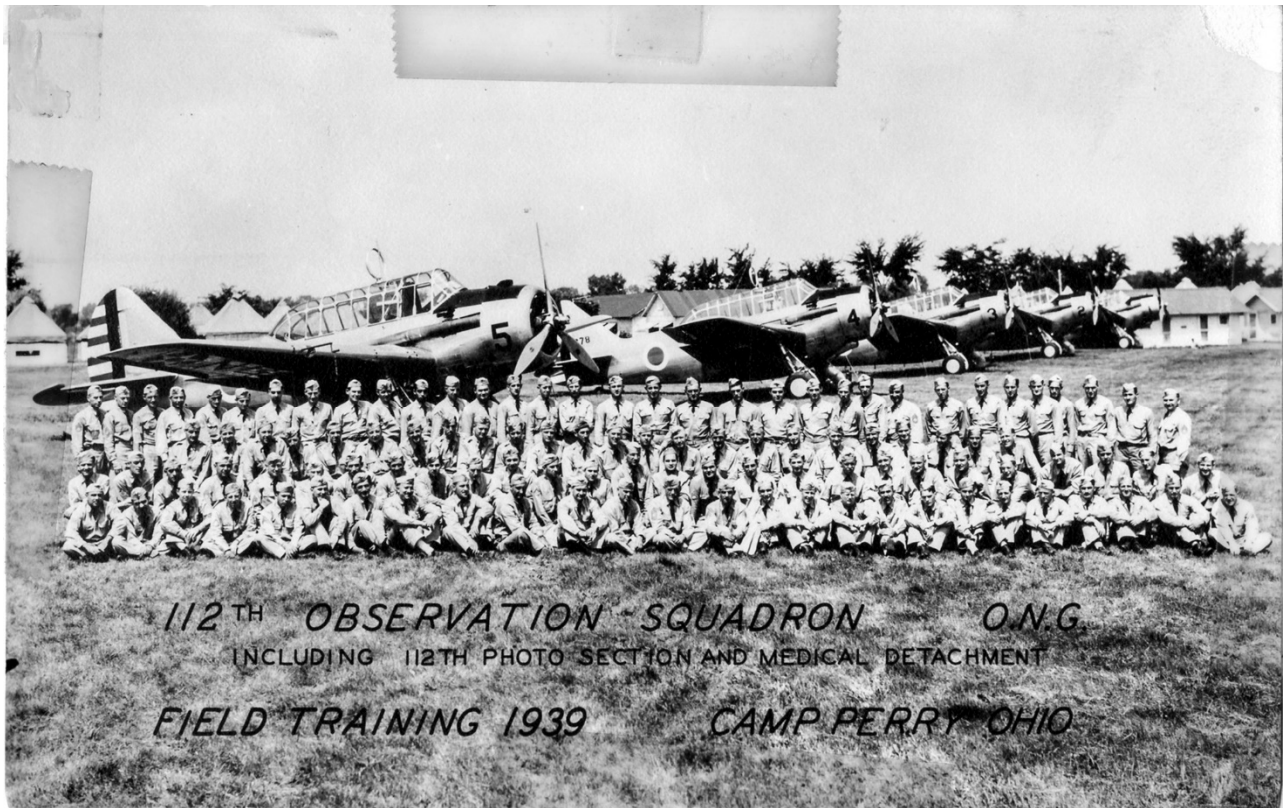
1939 112th Observation Squadron, Camp Perry, Ohio, 1939.