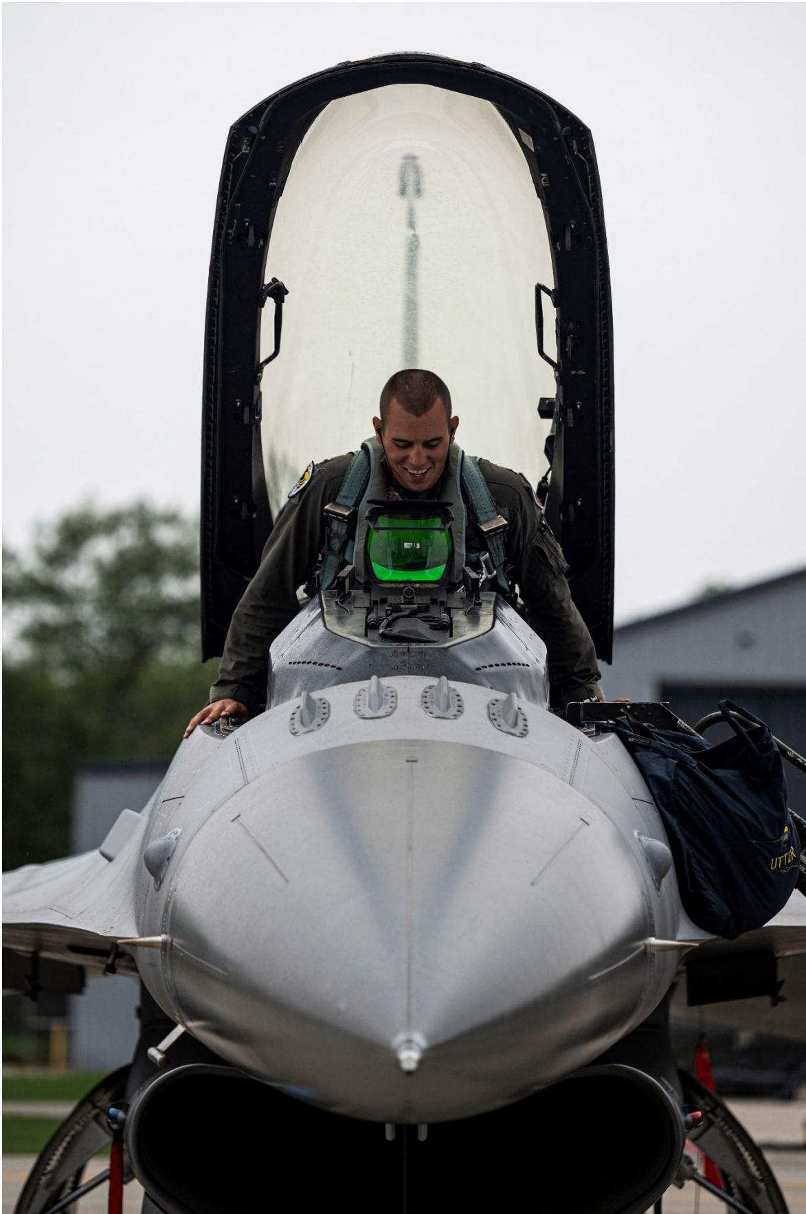
2021 First Lt. Joshua Utter, a F-16 Fighting Falcon pilot, steps into his aircraft during the Global Information Dominance Experiment 3 (GIDE 3) in conjunction with the Architecture Demonstration and Evaluation 5 event before a flight at Alpena Combat Readiness Training Center, Alpena, Mich., July 13, 2021.