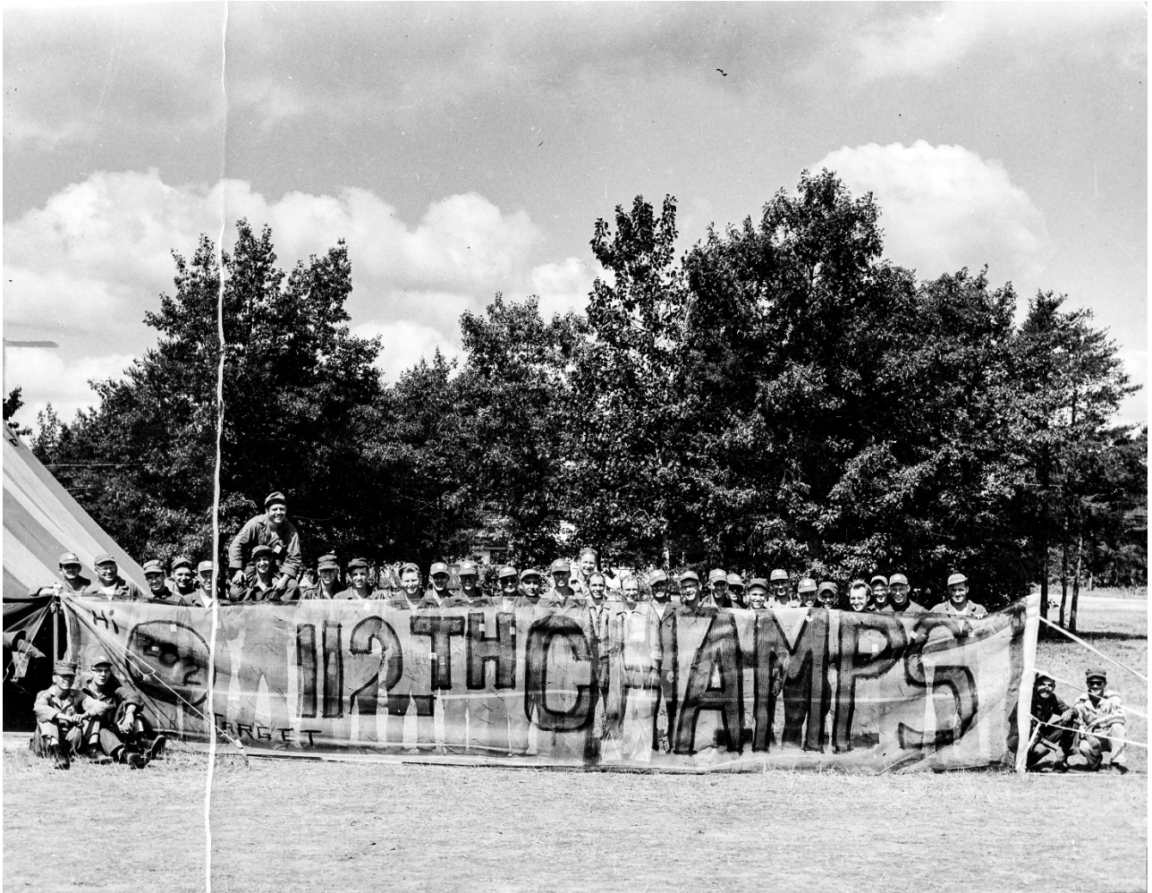
1954 112th Fighter-Bomber Squadron members are crowned "top gun" winners at field training in 1954.