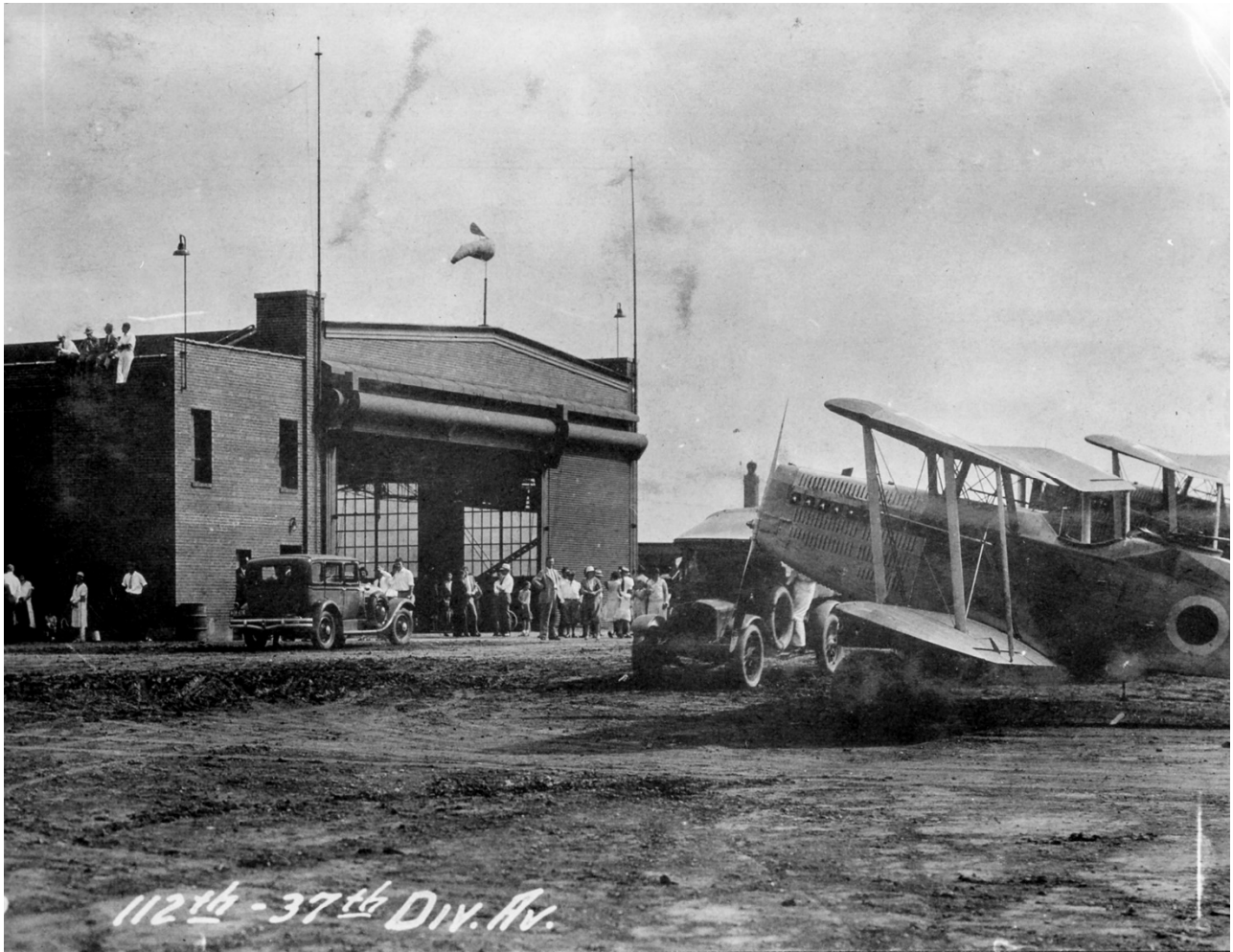
1931 112th Observation Squadron open house day at the Ohio National Guard hangar at the Cleveland Airport in 1931. The hangar was built by the state on the south edge of the airport in 1928 at the cost of $100,000 and was demolished in 1942 to make way for the expansion of the runways.