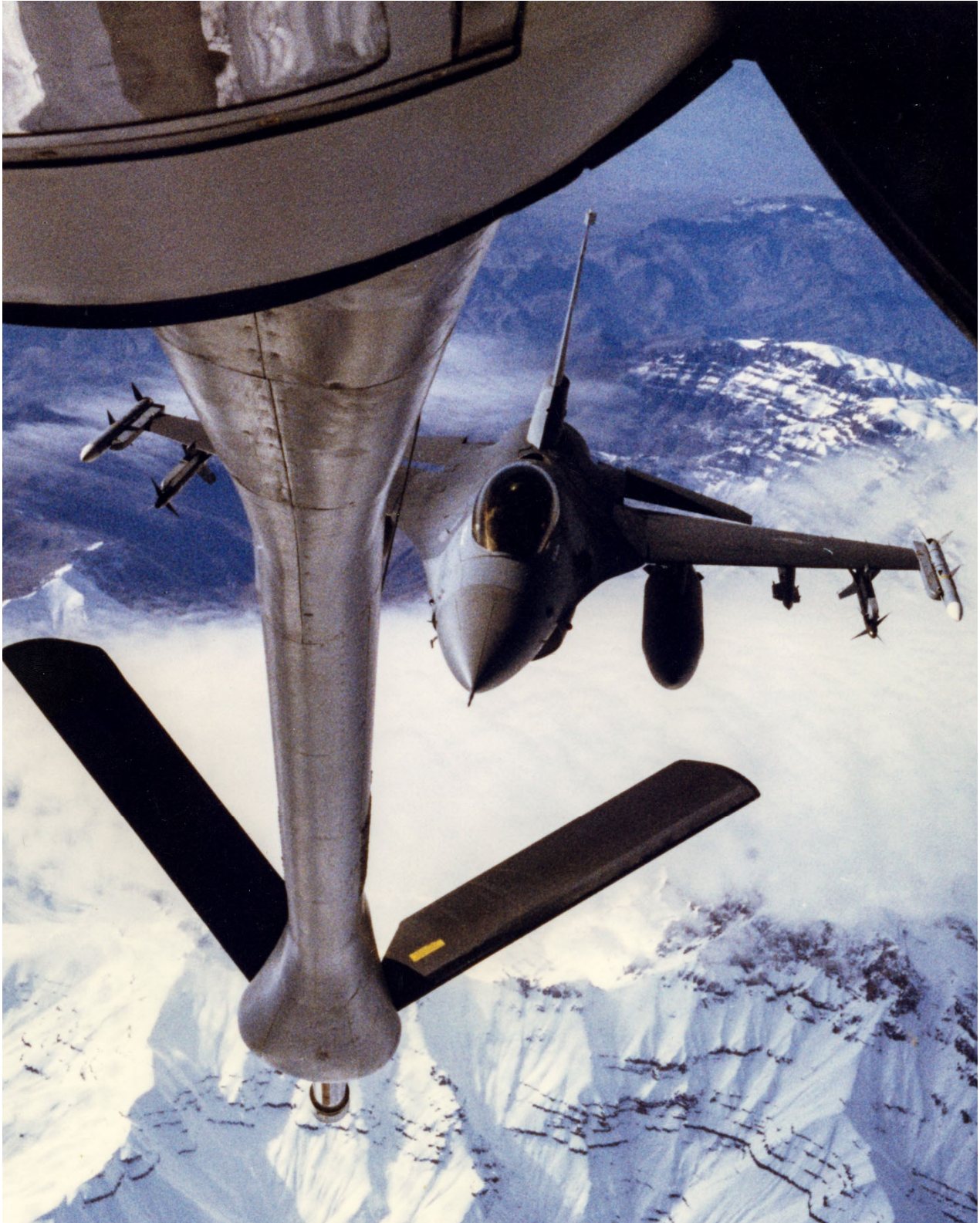
1996 A 112th Fighter Squadron F-16 fighter jet is refueled on Iraq's border by a KC-135 in December 1996. The unit enforced a no-fly zone as part of Operation Provide Comfort II from Dec. 7, 1996, through Jan. 7, 1997.