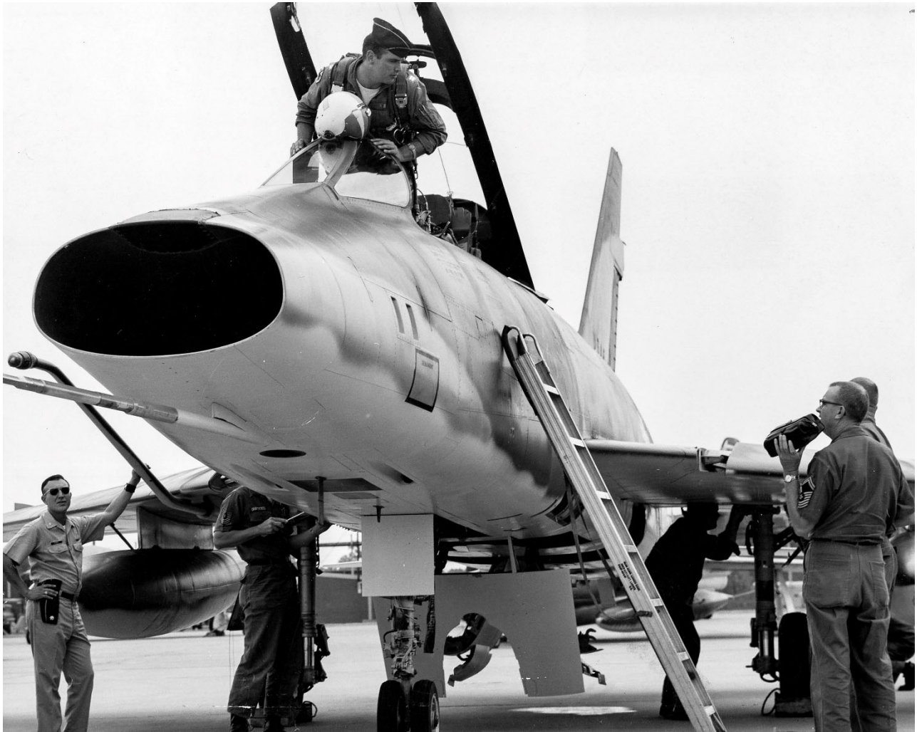
1970 Capt. Gary R. Chudzinski, a pilot assigned to the 112th Tactical Fighter Squadron, enters the cockpit of a F-100 Super Sabre jet equipped to the squadron in 1970.